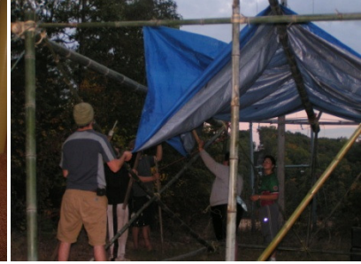
Building the Tabernacle!

As this week unfolds, the students hope to learn the power that can be found in prayer as they dive into the depths of prayer counseling and how much healing and restoration God wants for each life. Pray for each student as they begin to hear God's voice and follow his calling.