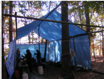
Common Shelter and Kitchen