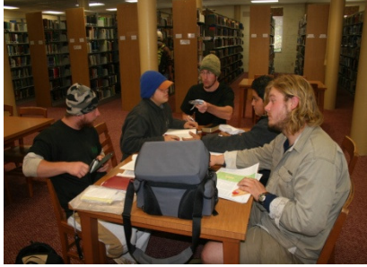
Researching the Tabernacle